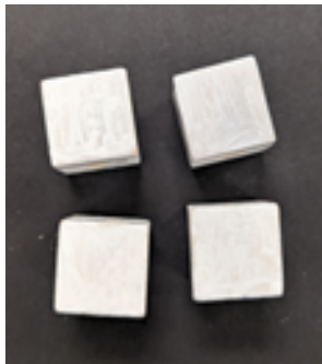
Steps 1 & 2